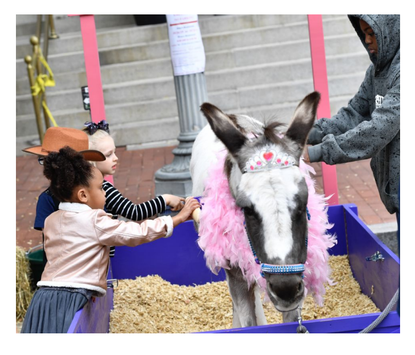
SATURDAY, OCT. 29 11 a.m.-2 p.m. Kids' Day, presented by Delta Air Lines Free admission Pony rides, grooming station, horseless horse show, pony kissing booth, and more!